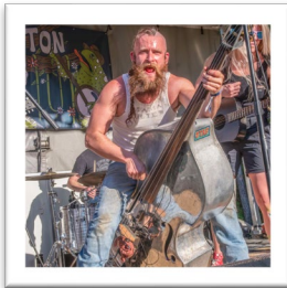
The Tan & Sober Gentlemen