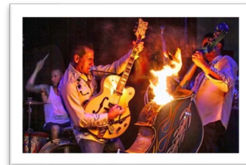
Hot Rod Walt & The Psycho-Deviles